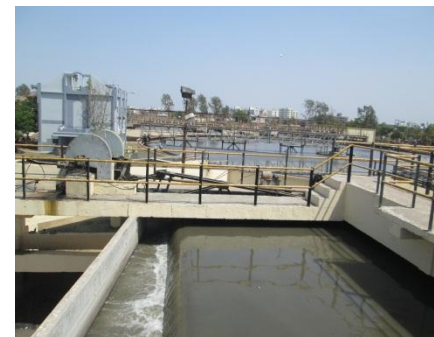
Railway Staff College and Sewage treatment Plant, Baroda

models and understand treatment process of sewage.